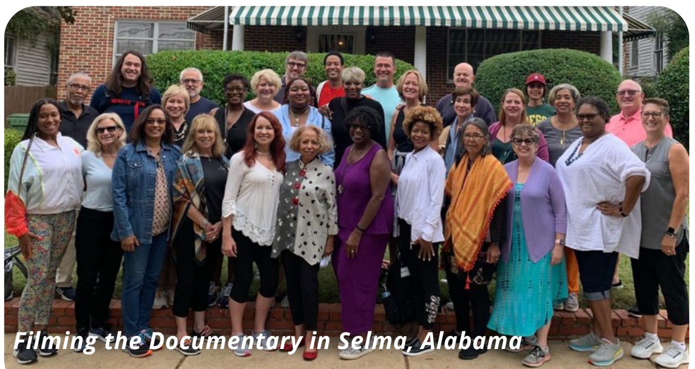
Filming the Documentary in Selma, Alabama

Providing over 2,000 members of the GTW community with resources to guide their diversity, equity, inclusion, and belonging journey.